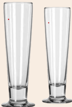
Beer Glass Tall set of 2