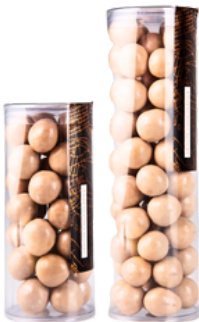
Atypic Chocolate Roasted Hazelnuts & White Chocolate