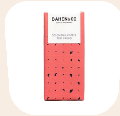
BAHEN & CO Columbian Coffee