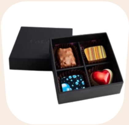
Cacao 4 Piece Artisan Chocolate Box