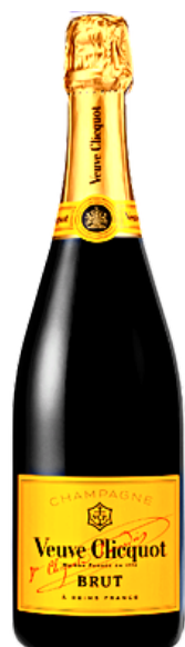
Veuve Clicquot Brut Yellow Label Champagne