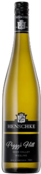
Henschke Peggy's Hill Eden Valley Riesling