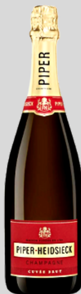
Piper-Heidsieck Brut Champagne