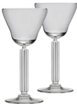
Art Deco Martini Glasses set of 2