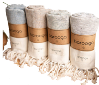
Turkish Cotton Hand Towels – Various Colours