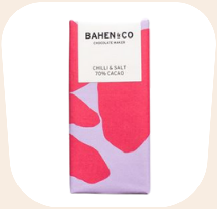
BAHEN & CO Chilli & Salt