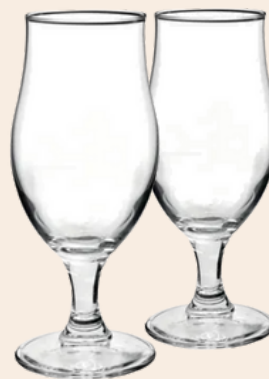
Beer Glass Executive set of 2