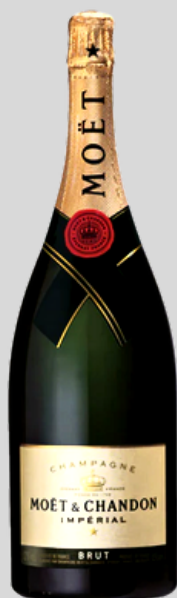
Moët & Chandon Brut Impérial Champagne NV