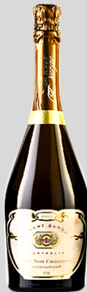
Grant Burge Pinot Noir Chardonnay