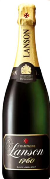
Lanson Black Label Champagne Brut