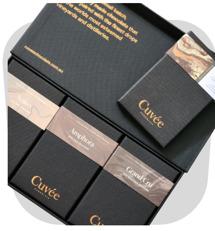
Cuvee' Wine Connoisseur Trio Pack Chocolate