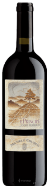
Michele Chiarlo Nebbiolo Il Principen