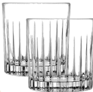
Glass Cut Tumbler set of 2