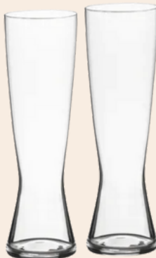
Beer Glass Pilsner set of 2