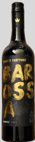
BAROSSA Pinot Noir