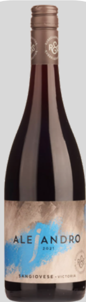
ALEJANDRO 2021 SANGIOVESE VICTORIA