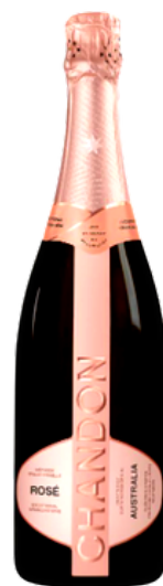
Chandon Brut Rose'