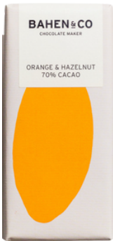
Bahen & Co Orange Hazelnut