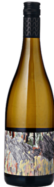
MULLINE Sutherlands Creek Fume Blanc, 2021