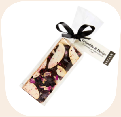
Brambleberry & Hedge Nougat