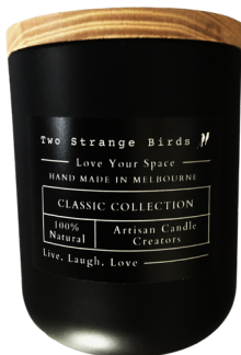
Scented Soy Candle Hand Poured in Melbourne