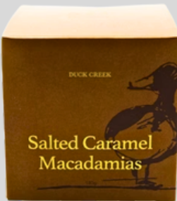
Duck Creek Salted Caramel Macadamias