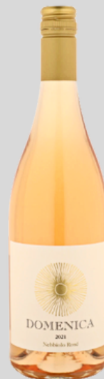
Domenica Nebbiolo Rose'