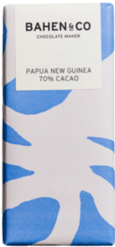
Bahen & Co Papua New Guinea