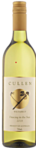
Cullen Mangan Sauvignon Blanc Semillon