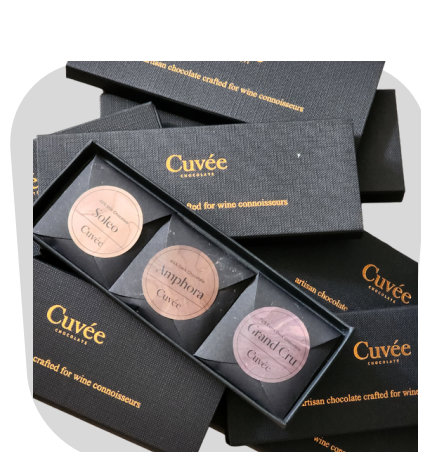
Cuvee' Mini Wine Connoisseur Chocolate Trio