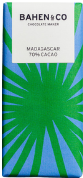
Bahan & Co Madagascar