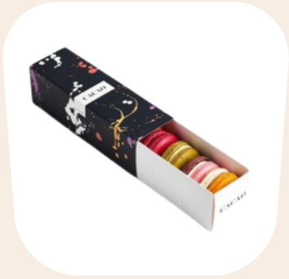
Cacao Macaroons pack of 6