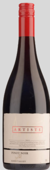
ARTISTE Pinot Noir