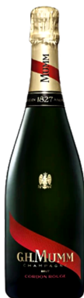
Mumm Cordon Rouge Brut Champagne NV