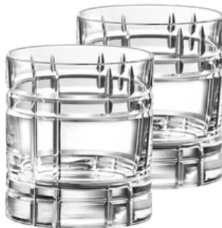
Modern Cut Glass Tumbler set of 2