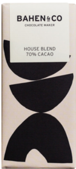
BAHEN & Cc House Blend