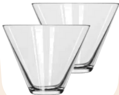
Stemless Martini Glass set of 2