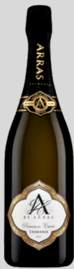
A By Arras Premium Cuvée NV