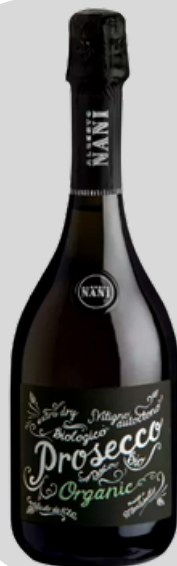
Alberto Nani Organic Prosecco