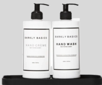
Barkley Basics Hand Wash & Hand Cream Duo