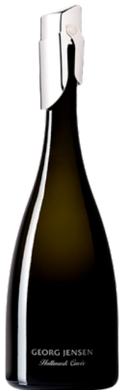
Georg Jensen Hallmark Cuvée Sparkling White