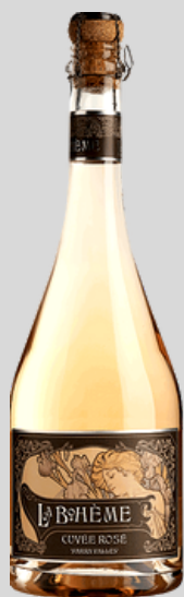
La Bohème Cuvée Rose'