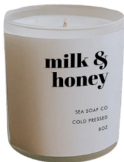
Scented Soy Candle Hand Poured in Melbourne