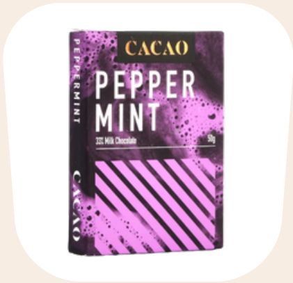
Cacao Assorted Artisan Chocolate Blocks