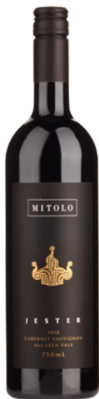
Mitolo Jester Cabernet Sauvignon