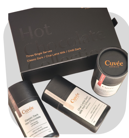
Cunee' Hot Chocolate – Large single or Mini Trio Pack