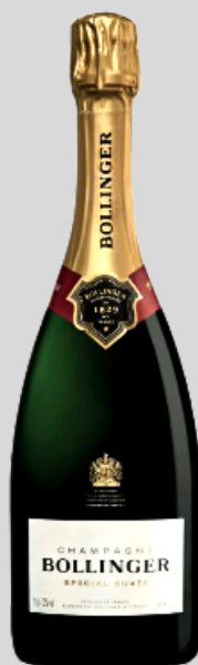
Bollinger Special Cuvée Champagne