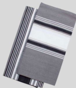
Dish Towels – Different designs available