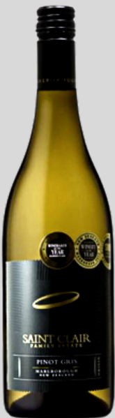
Saint Clair Family Estate Origin Pinot Gris 2019 Marlborough