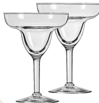
Margarita Glass set of 2