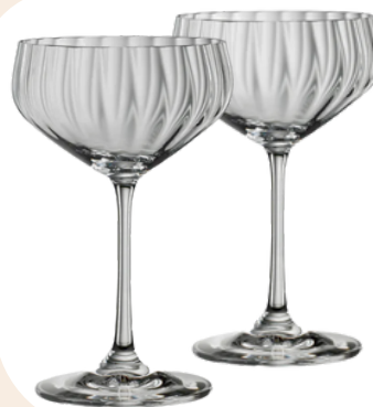
Glass Coupette set of 2